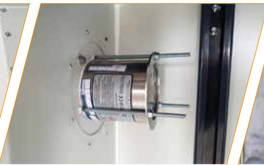
Aerosol generator for fire fighting