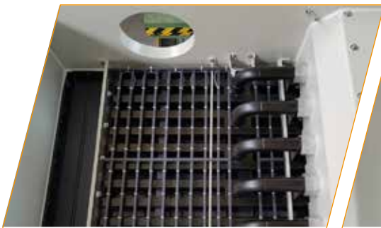
Heat detection for fire detection