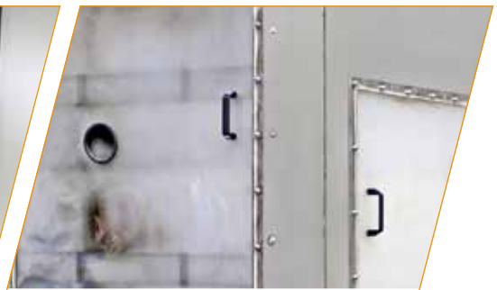
Spread of aerosol when fighting a fire